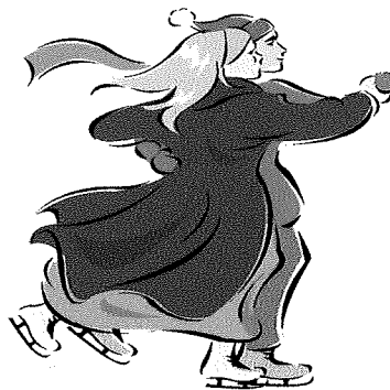
Do you still have the ability to ice skate? The City of Olmsted Falls floods East River Park for your enjoyment.

would join us. The opportunity to socialize together in new environments while enjoying a meal with no muss, fuss, or cleanup always draws an enjoyable group.